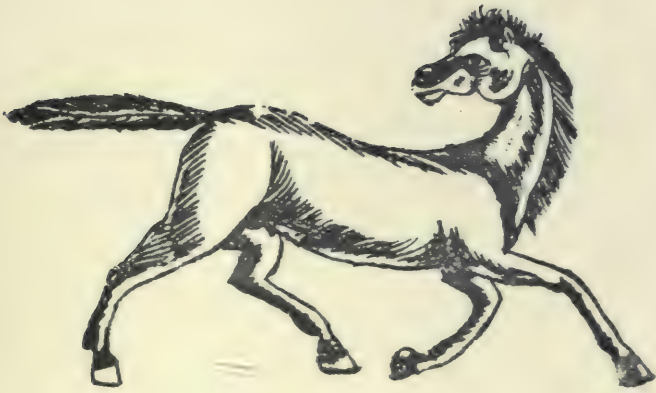
A "STRAP-NECKED HORSE"